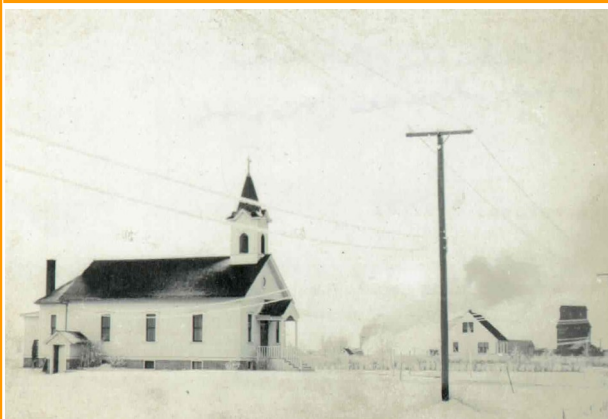
The Galchutt Church before the north SS addition & south dining room addition were added. (above & below)

The weekly bulletins will usually be printed on Thursday mornings by the Administrative Asst. so if you have items that need to be included, please email them to emmanuelgalchutt@gmail.com by Wednesday night.