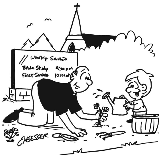
"Let's give 'em a good start with some holy water!"