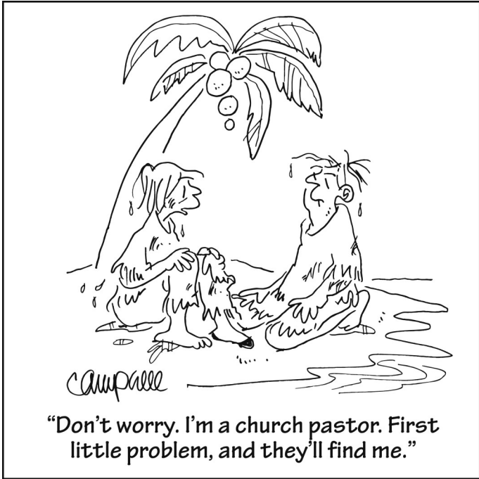
"Don't worry. I'm a church pastor. First little problem, and they'll find me."