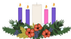
Fourth Sunday of Advent

9 AM Worship at Galchutt Lutheran 9:30 Galchutt & Emmanuel Sunday School 10:30 AM Worship at Emmanuel