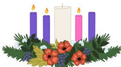
Third Sunday of Advent

9 AM Worship at Galchutt Lutheran with communion 9:30 AM Galchutt & Emmanuel Sunday School 10:30 AM Worship at Emmanuel with communion 11 AM - 1:30 PM Emmanuel 29th Annual Meatball dinner, raffle & bake sale