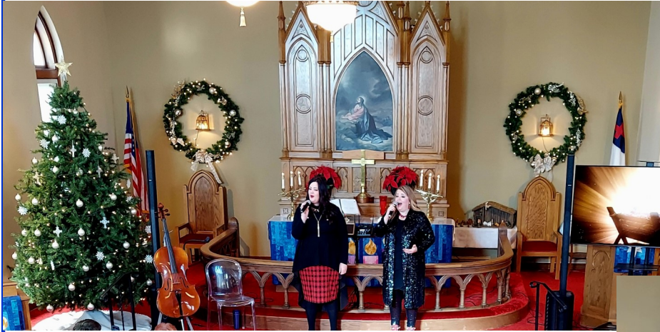
December 3 - The Preacher's Daughters were amazing in concert, as usual!!