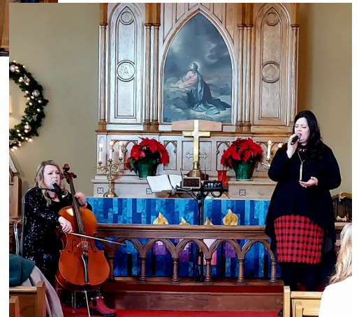
December 17 - Sunday School Christmas programs.