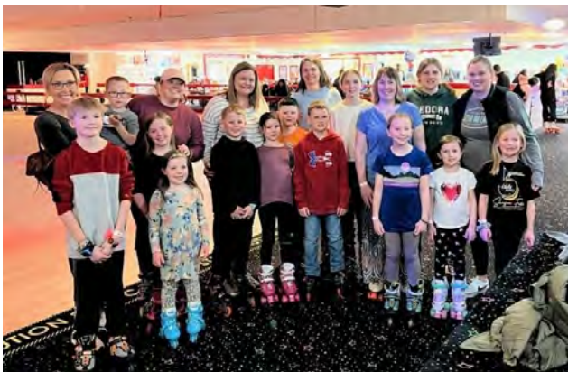
17 skaters enjoyed an afternoon of fellowship at Skateland on February 25th.